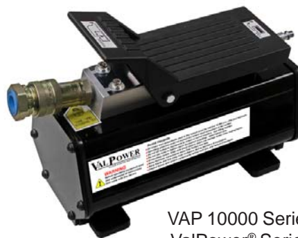
VAP 10000 Series ValPower® Series Pneumatic Pump

Contact a sales and application engineer at (219) 462-6128 or visit us on the web at