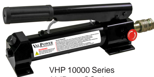
VHP 10000 Series ValPower® Series Hand Pump